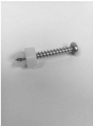
5. Thread screw onto well nut.