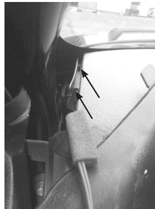
7. Align tabs on bottom of pillar with factory slots in dashboard.