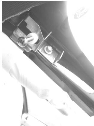
6. Place well nut into slot, then remove the screw.