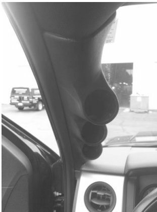
9. Pillar sits behind door weather stripping.