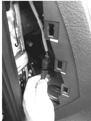
2. Disconnect factory speaker. (applicable for speaker models only)