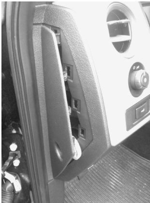
1. Remove dash side panel. (applicable for speaker models only)