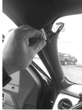
3. Remove factory pillar.