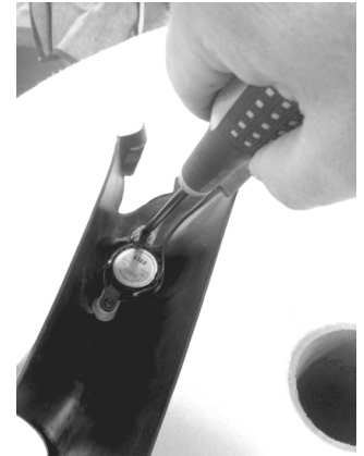
4. Install factory speaker into the new pillar. (applicable for speaker models only)